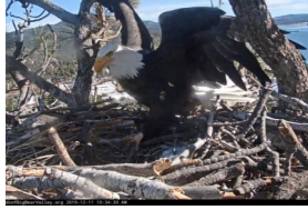
BB Bald Eagle Nest Cameras