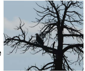
Bald eagle on site—this perch tree was later illegally removed by developer.

The trial court, based on previous rulings from the state appeals court, ruled that the County's original approval of the Marina Point development project has expired according to the County's own development code.