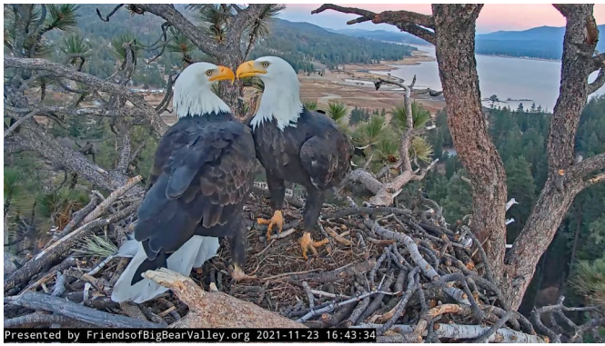
The 'Love Birds' are back for a new nesting season!