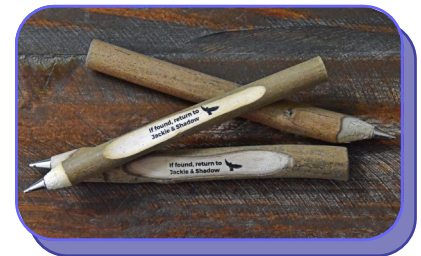
"If found, return to Jackie & Shadow"

Please visit our online shop: https://www.friendsofbigbearvalley.org/shop/