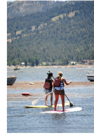
BB Outdoor Adventure Days