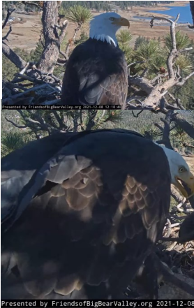
Having a bit of a 'discussion' over where this particular stick belongs.

even started bringing fluff to the nest...which seemed to surprise Shadow. Her most frequent egg-laying time from past years is early January. We will be fascinated to watch and see what this season brings.