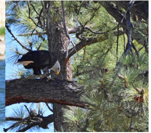
After the Jackie & Shadow Fan party, our "Eagle Team" went looking for eagles...and got to see Jackie catch a fish and have lunch in a nearby tree.