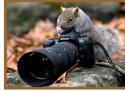
Environmental Education and Advocacy