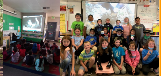
New Educational Programs