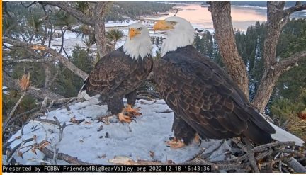
Big Bear Bald Eagle Cameras