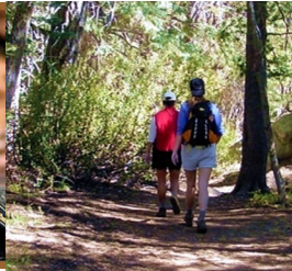
Bear Valley Ecotourism Coalition