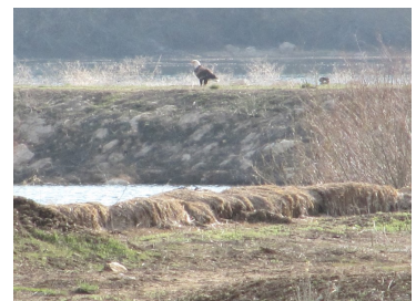
Bald eagle foraging on site