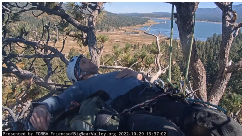
Nate Melling, about 6' tall, shows size of nest

...until the next big storm. This 2-1/2 day storm had even stronger winds (67 mph gusts), intense rain (1.2 inches in 1 hour, 2.1 inches total), and then freezing temperatures and snow. Many snag trees were felled by the winds, including one of Jackie and Shadow's favorite perches, and much of the valley was without power for two days. The camera stayed in place, but in the middle of the storm, it suddenly stopped working! Also, the microphone on the wide angle camera became garbled. It took many days of running system tests, researching possible issues and tracing connections, but we finally found the causes—one of the connectors along the few hundred feet of cable had lost its weatherproofing, gotten corroded and stopped transmission; the 2nd mic had filled with water; and the internet connection cables had gotten loose and 'wonky'. We quickly replaced all of those, just under the wire before Jackie and Shadow got serious about nesting—many thanks to Shadow for being stubborn about letting go of summer vacation! And all is well once again.