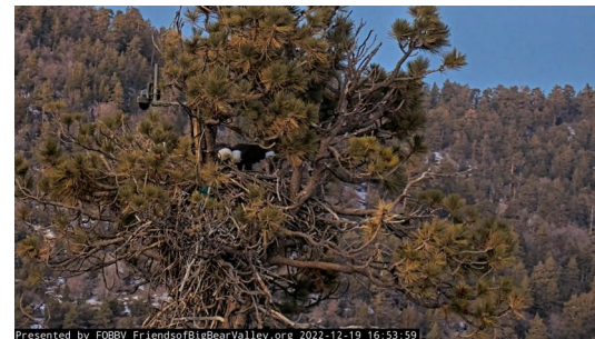
New wide angle camera with powerful zoom