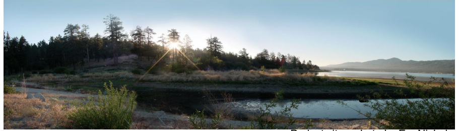
Project site

Background: In 2020, Friends of Big Bear Valley, Center for Biological Diversity and San Bernardino Valley Audubon Society filed a legal challenge under CEQA (California Environmental Quality Act) to the County approval of Moon