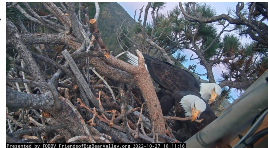
Sideways camera view

This is not as easy as it might seem—this climber must be able to climb the 150 foot tree on only ropes so as not to damage the tree, have all the needed special equipment, be permitted (both state and federal) to work in bald eagle nests, be proficient in installing electronics and most difficult of all—be available in our small window of time before the eagles returned to start nesting.