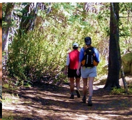
Big Bear Valley Ecotourism Coalition