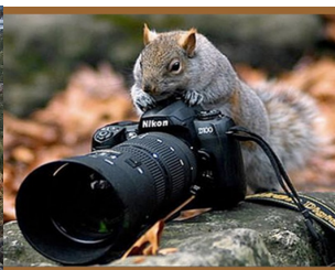
Environmental Monitoring and Advocacy