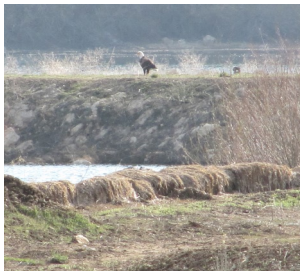
Bald eagle foraging on site