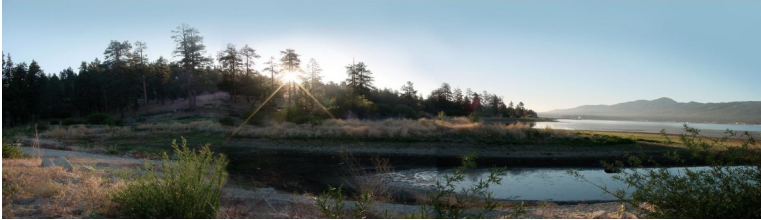
Project site