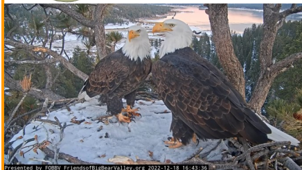
Big Bear Bald Eagle Cameras