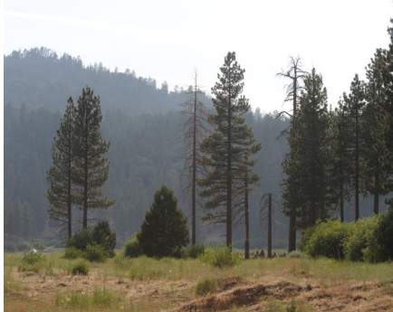
Project site on the north shore

We are currently working with other agencies to have the huge pile of asphalt removed, a real eye sore amongst the beautiful nature around it. Currently, all development is halted until the appeal decision is final.