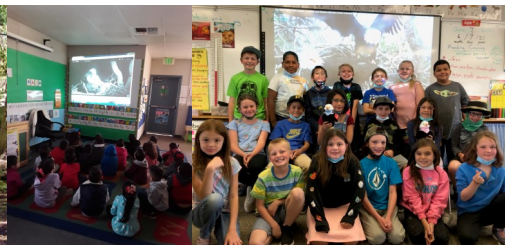
New Educational Programs