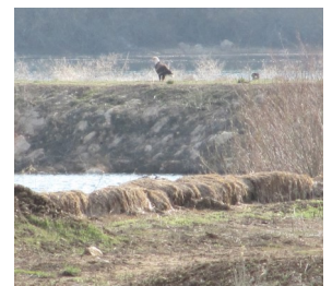
Bald eagle foraging onsite

We won the most recent round of retrials and appeals, but another appeal has been filed. Currently, all development is halted until the appeal decision is final. It might be a few months before we have any final information.