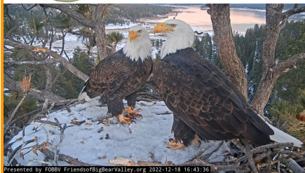
Big Bear Bald Eagle Cameras